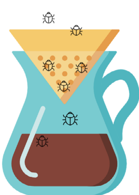
Traditional Anti-Virus programs behave like a filter