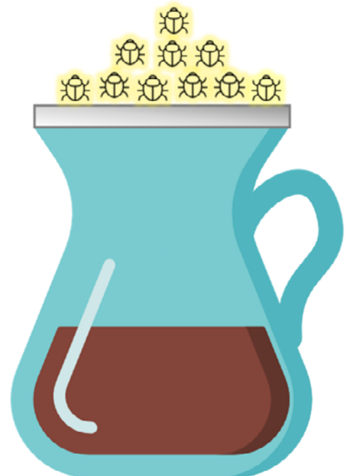
A9X VoodooShield behaves like a lid (an auto-toggling computer lock)